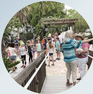
A fourth grade group at the village.

We welcomed groups ranging from fourth graders who rode their bikes from the Sanibel School to Road Scholars bus tours. No matter their ages, how they arrived, or where they came from, the tour-goers' response was utterly enthusiastic.