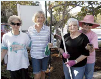
Garden Club members