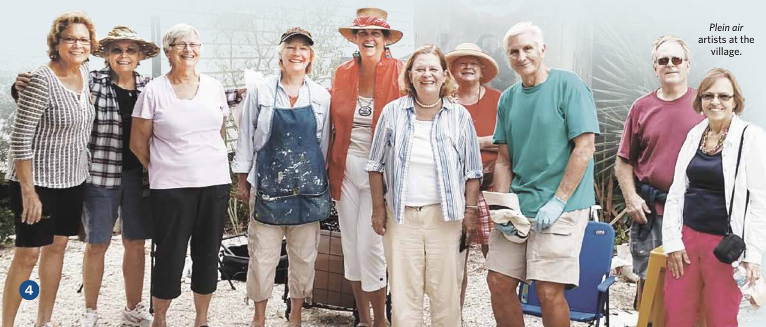
Plein air artists at the village.

The Sanibel-Captiva Rotary Club once again awarded the Historical Village $3,000 to cover children's admissions. We're very grateful for their support over the past several years!